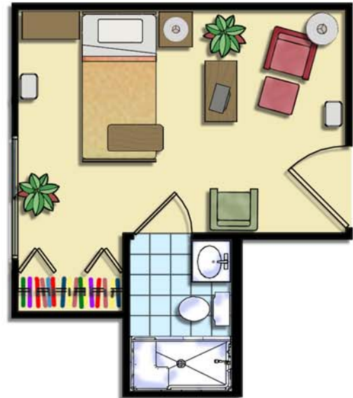
PRIVATE SUITE 263 s.f. (16'-0" x 11'-0")